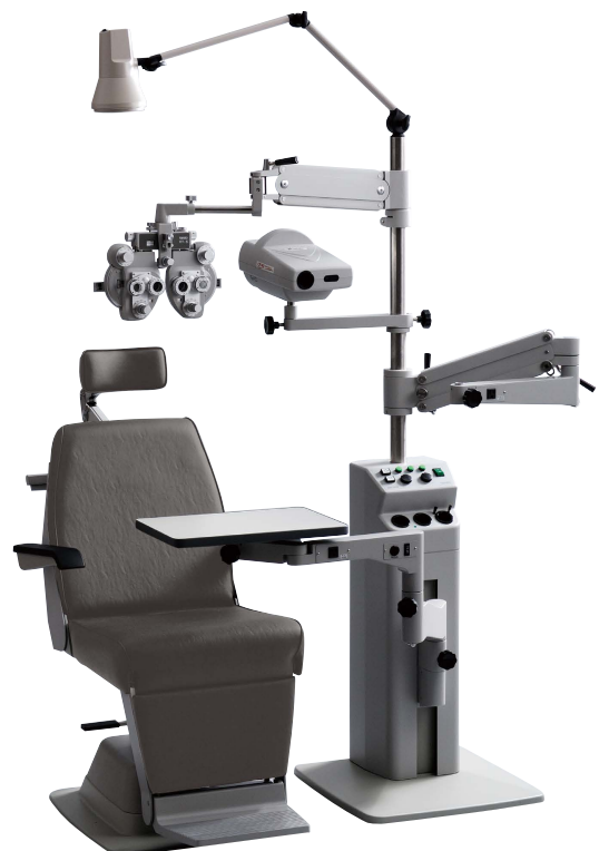
SN-500 combined with Ophthalmic Chair UN-15

* VT-5 View tester, CP-40 Chart projector, UN-15 Ophthalmic chair, U08-04 Projector arm, and U12-05 Slit lamp table top are separately available.